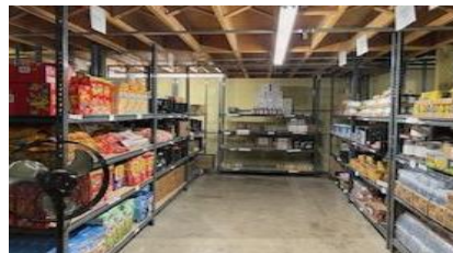
Inside WSCP Pantry