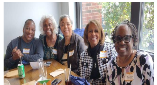
WSCP Volunteer Appreciation Lunch in April 2024